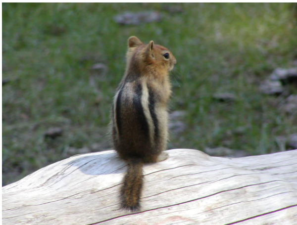
Perhaps part of the camping experience