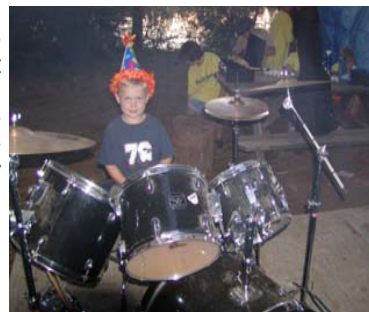
Siblings have fun also.

Medical educational activities assist parents and campers in becoming responsible for their individual health programs.