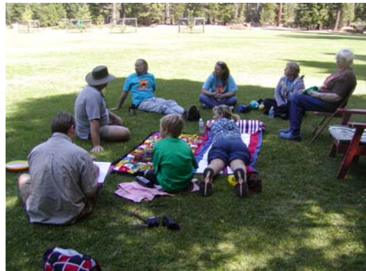
Kids play while parents learn