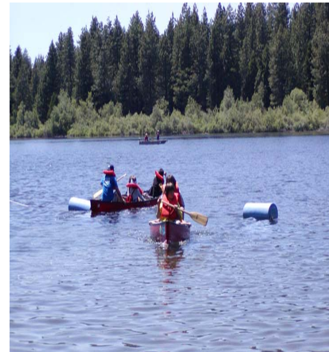
Fun time on Lake McCumber

The Ultimate Camp for The Child with Diabetes June 24 through 30, 2012