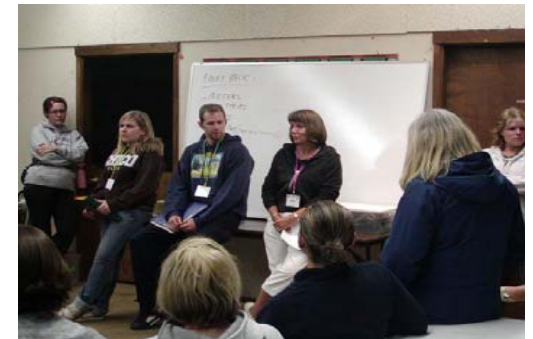
Counselor Training Update

We provide enough Counselors to supervise and meet the individual needs of all the campers. Counselors receive basic training in supporting the medical staff and assisting campers. Counselors are selected from Lions, Lioness, students, teachers, etc. Counselors are role models for campers and positively impact each camper's experience.