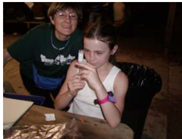
Time for insulin

Medical educational activities assist campers in becoming responsible for their individual health programs.