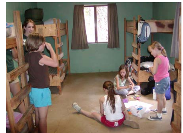
Working on a Poster for their Cabin

An excellent kitchen staff provides three hot meals a day, which are appropriate for the individual with diabetes. Nutritious snacks are also provided at appropriate intervals throughout the day and evening. Food is an important part of diabetes management and we strive to help campers make healthy food choices.