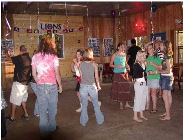
Friday Night Dance Time

Wake-up Flag Raising Testing/Breakfast/Showers Activity One Snack Activity Two Testing/Lunch Camp & Cabin Clean-up/Quiet Time All Camp Activity Snack Free Time Flag Lowering/Announcements Testing/Dinner/Showers Evening Activity Campfire Testing/Snack Lights Out (youth)/Night Activity (teens) Midnight Testing/Lights Out (teens)